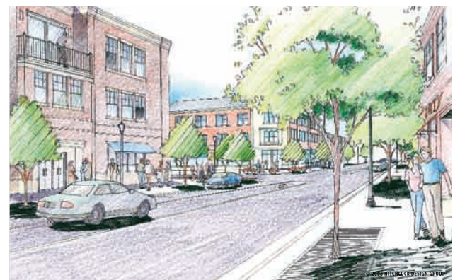
View east along Lincoln Highway towards the intersection of 6th Street.