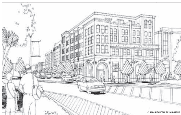
View west along Lincoln Highway towards the intersection of 4th Street.