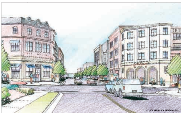
View east along Locust Street towards the intersection of 1st Street.